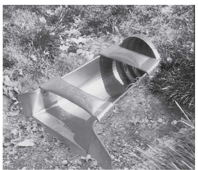
Low-Slope End Section is shown with optional fieldattached safety bars.