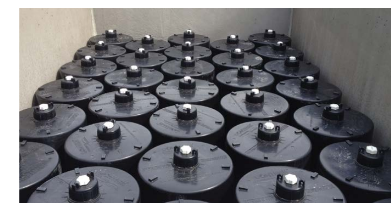
The Stormwater Management StormFilter®

Filterra is an engineered high-performance bioretention system. While it operates similarly to traditional bioretention, its high flow media allows for a reduction in footprint of up to 95% versus conventional bioretention practices. Filterra provides a Low Impact Development (LID) solution for tight, highly developed sites.