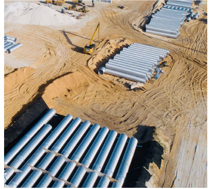
E-commerce infrastructure is driving the need for larger stormwater detention systems.