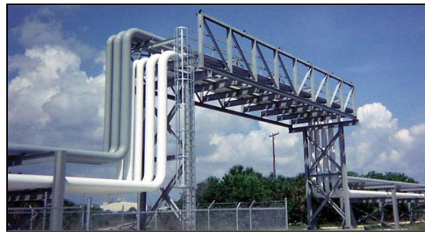
Elevated Structures - designed to meet project owners' clearance requirements