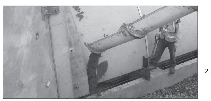
* Option B does not require grouting of the keyway.