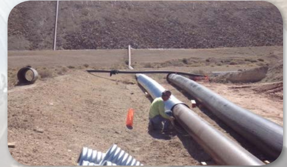
Superior strength to weight ratio of steel.

Sections are nested into compact, easy-to-handle bundles for economical transportation.