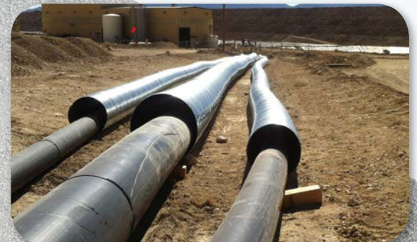
Encase solid wall HDPE (or any plastic pipe) with Nestable CSP underneath haul roads, embankments, etc.