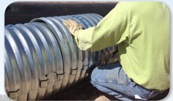
Assemble quickly & efficiently with a screwdriver and a mallet.