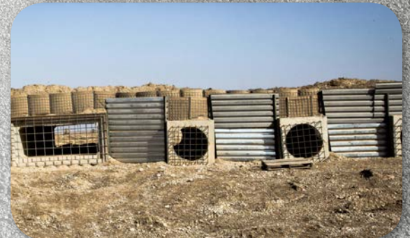
Nestable CSP can be used to build a land bridge in remote applications.