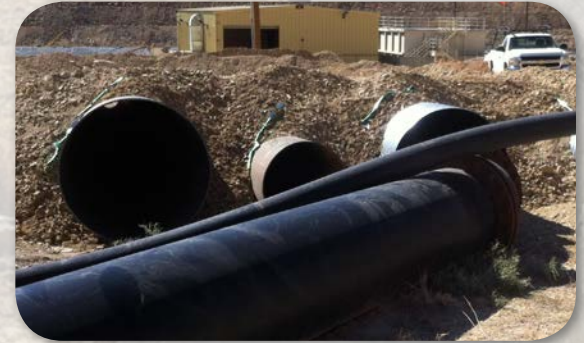
Sections can be nested into compact, easy-to-handle bundles allowing for economical transportation.