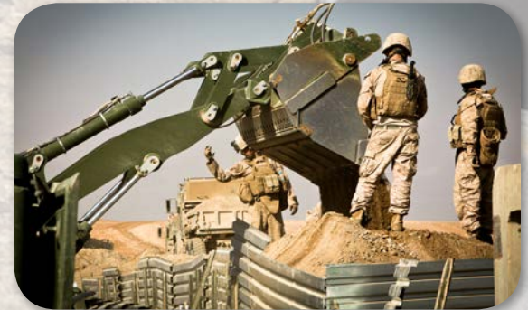
Heavy loading conditions ideal for haul roads.