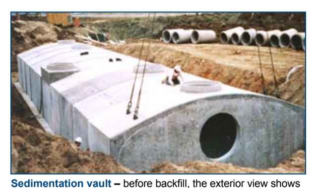
the integral endwall included in the design (New Hampshire)