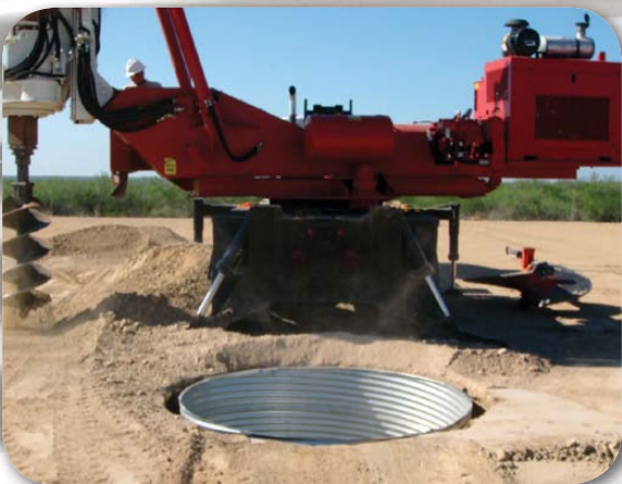
CSP Cellars provide a safe recess to ground surface access.

A cellar is a large diameter pipe that is set into the ground to provide the initial stable structural foundation for a borehole or oil well providing a recess to ground surface for access and safety. This is typically set before any drilling operations are performed.