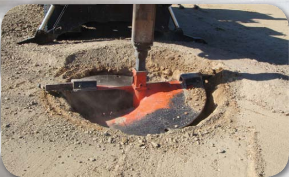
Setting the cellar occurs prior to any drilling.