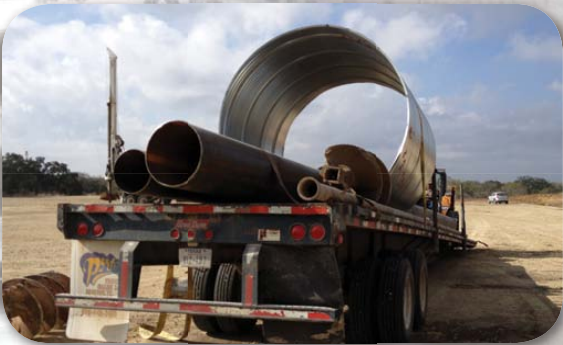
Lightweight for easy handling and transportation.

Sections are lightweight for economical transportation to the well.