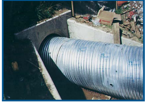
Drainage solutions include ULTRA FLO®, Smooth Cor™, HEL-COR®, Contech Slotted Drain™, DuroMaxx™ and Reline Solutions included SPR™ PE.