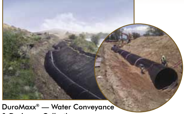
& Drainage Collection