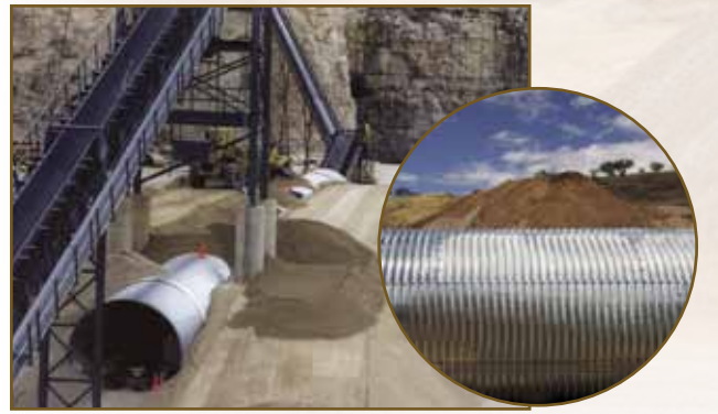
MULTI-PLATE® & Corrugated Steel Pipe— Conveyor

Our mission is to significantly strengthen our industry leadership position by offering innovative civil engineering solutions to our customers and providing the highest quality, cost-effective solutions and service to the mining, energy, military and industrial markets in North America.