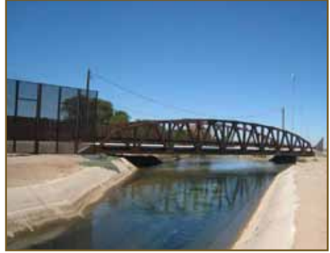
U.S. Bridge® Vehicular Truss — Stream Crossing