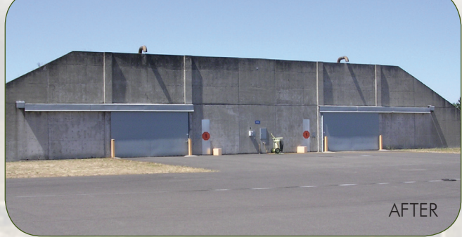
Numerous structures have been installed in bases around the country for the past 35 years.