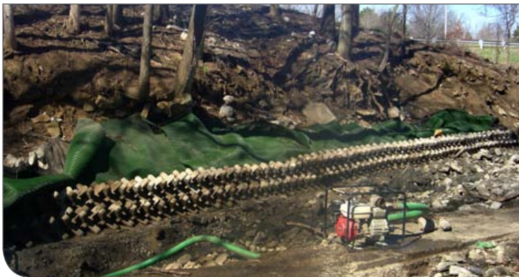
Indian Creek Clinical Building (KS) – stream bank stabilization (A-Jacks)