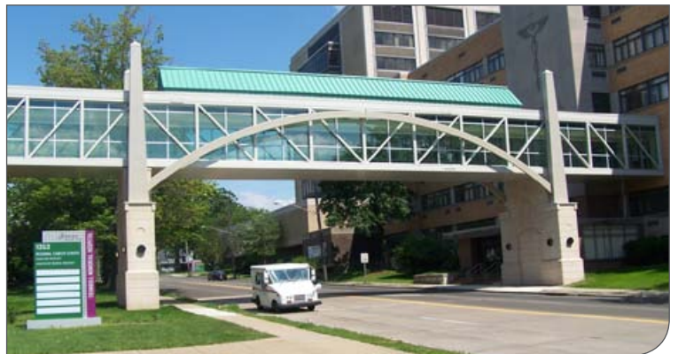
Trumbull Hospital (OH) – skywalk connects facilities (Continental)