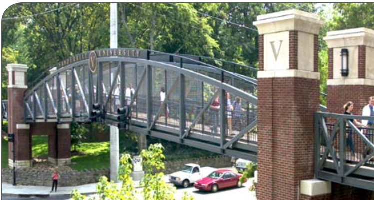
Vanderbilt University (TN) – overpass for student walkway (Continental)