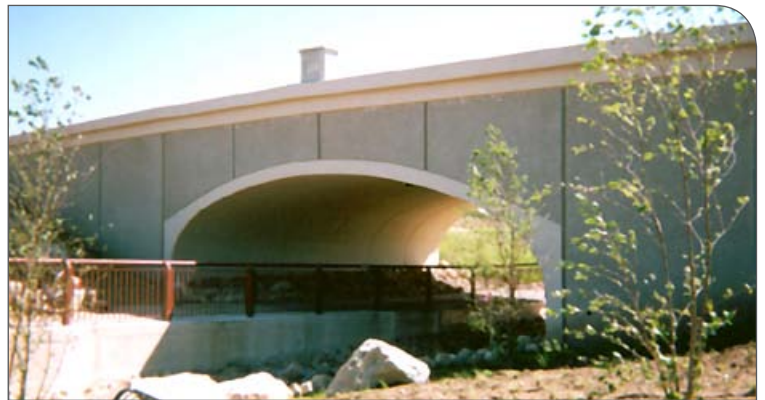
Western Michigan University (MI) – joint pedestrian underpass and drainage channel crossing (CON/SPAN)