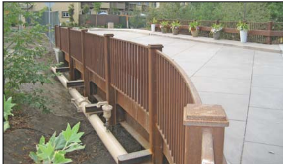
Attached Utilities – piping or utilities can be attached below or on the side of a vehicular or pedestrian structure