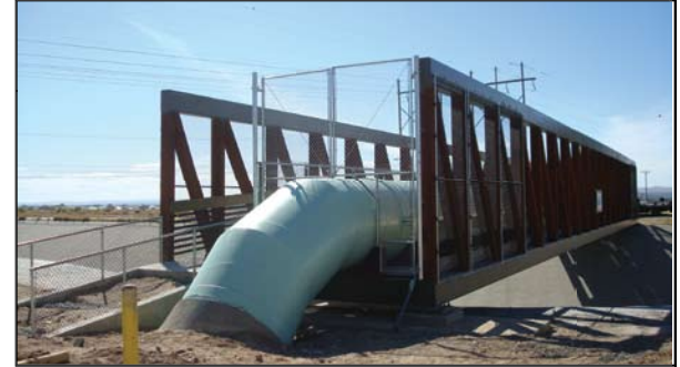
Dual Applications – pipe support structures may also provide necessary pedestrian walkways