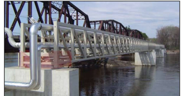
Long Span Solutions – single truss pieces can be combined to span large areas or waterways