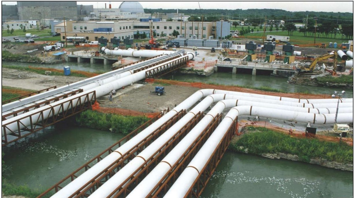
Multiple Structures – support 72" diameter pipes carrying extreme temperature liquids at a nuclear facility