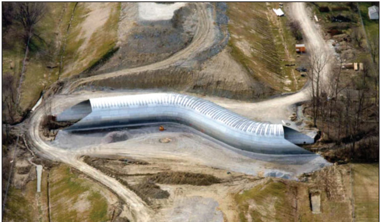
SUPER-SPAN™ high profile arch spans a wetland and provides a wildlife crossing.