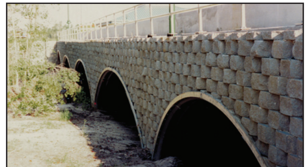
SUPER-PLATE® - animal crossing