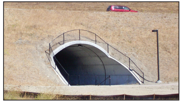
SUPER-SPAN™ - with sloped collar