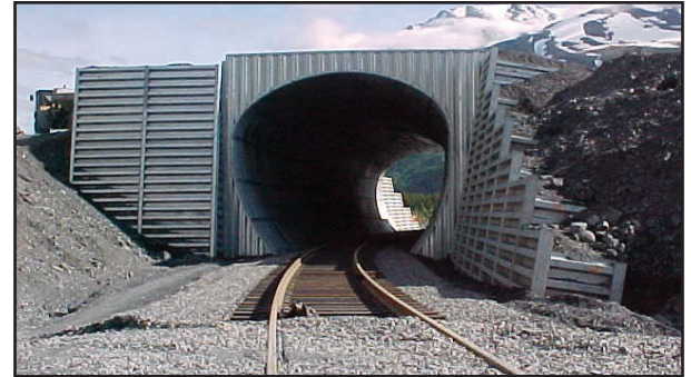
SUPER-SPAN™ - railroad underpass