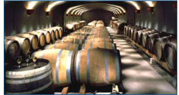
Wine cave – multiple cells with earthen floor support natural temperature and humidity control (Oregon)