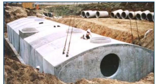
Sedimentation vault – before backfill, the exterior view shows the integral endwall included in the design (New Hampshire)