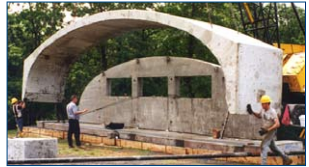
Bunker – the portable demolitions training bunker uses minimal existing space at West Point Academy (New York)