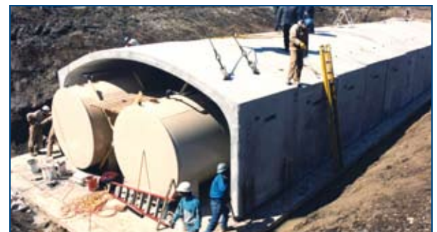
Containment vault – provide above-ground containment benefits to buried chemical storage tanks (Ohio)