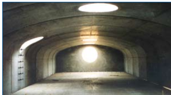
Sedimentation vault – interior view illustrates accommodations for large openings (New Hampshire)