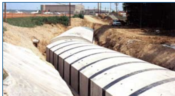
Glycol recovery tank – twin 96-ft-long Glycol recovery tanks for the Greater Cincinnati Int'l Airport (Kentucky)