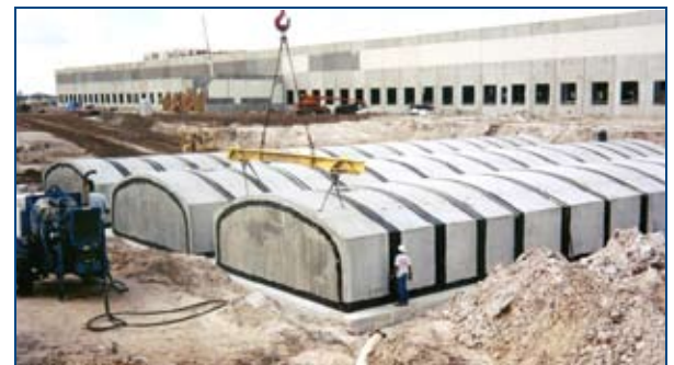
Retention vault – features pressure-resistant joints to prevent infiltration due to high water table (Florida)