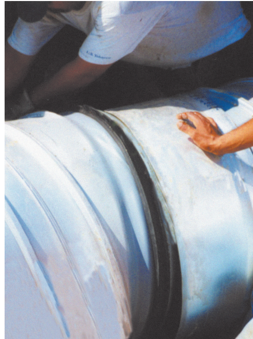
Bell and Spigot Coupling System for CMP

The QUICK STAB bell and spigot joining system allows pipe segments to be joined quicker than reinforced concrete pipe. Next, add in Contech's corrugated metal pipe's length advantage—each segment is four times longer than standard concrete pipe lengths. That means fewer joints and faster installation—up to four times faster! Plus, with the bell only 1-1/2" larger than the pipe, trench excavation is considerably less compared with concrete—again, saving time and money.