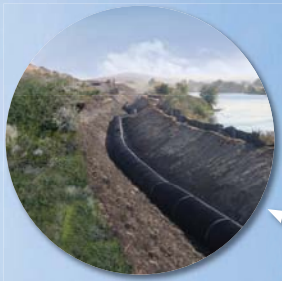
Barker Ranch, WA