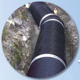
Yakima Tieton Irrigation District, WA