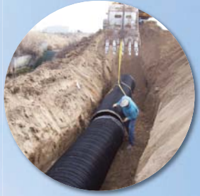
East Columbia Basin, WA