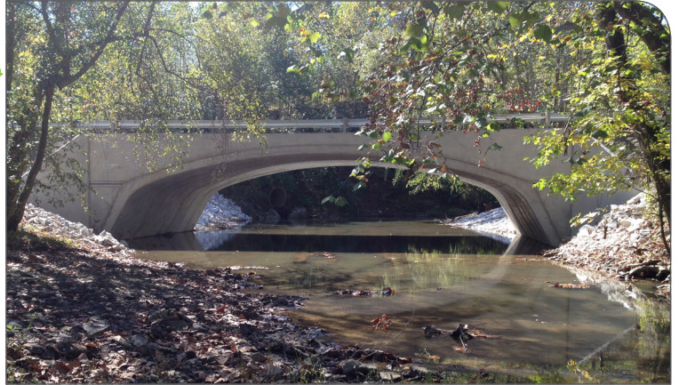
KYTC687 - Clay County, Kentucky