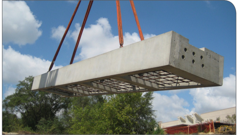
Retail Development - Blaine, Minnesota - EXPRESS Foundations used with CON/SPAN Bridge System