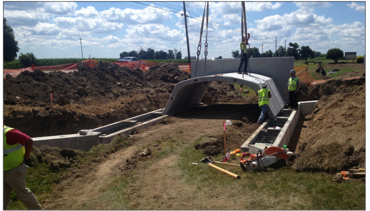
Fowler High School - Fowler, Michigan - EXPRESS Foundations used with CON/SPAN O-Series