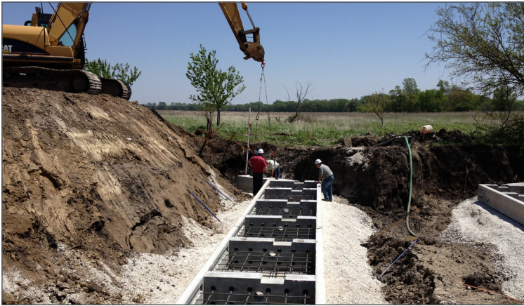
INDOT SR 55 over Gruden Ditch - Kentland, Indiana - EXPRESS Foundations used with CON/SPAN Bridge System