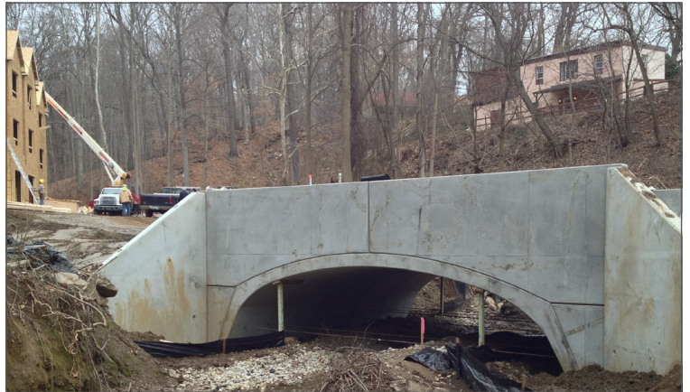
Shawmont Avenue - Philadelphia, Pennsylvania