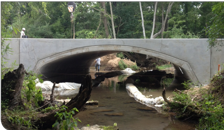
Stream Valley - Franklin, Tennessee