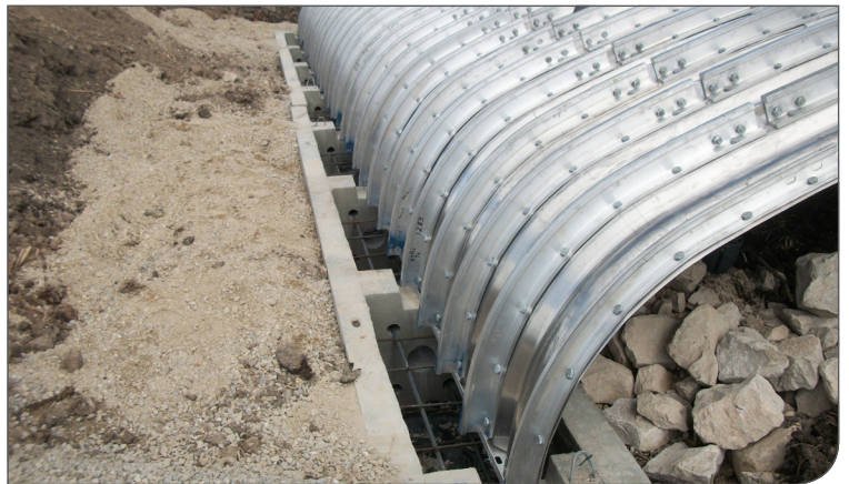
Brown County - New Franken, Wisconsin - EXPRESS Foundations used with Aluminum Box Culvert