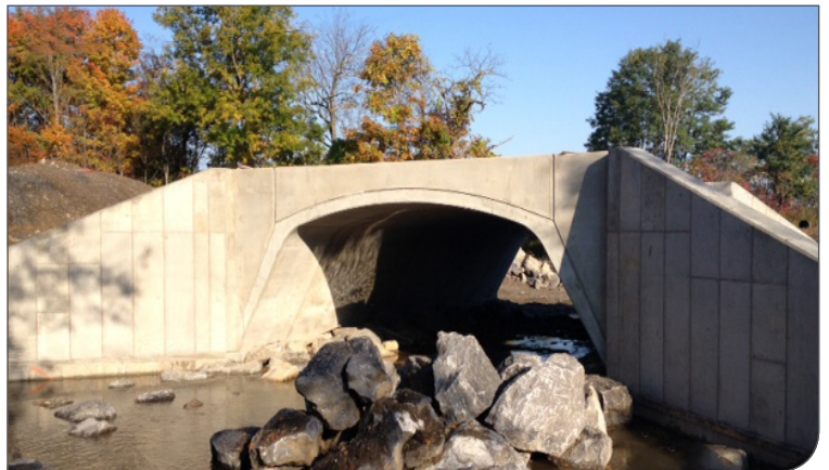
Duanesburg - Churches Road - Duanesburg, New York