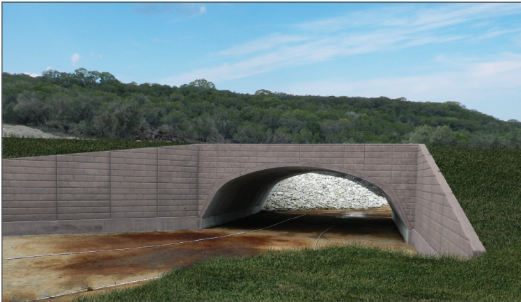
Tessera on Lake Travis - Lago Vista, Texas