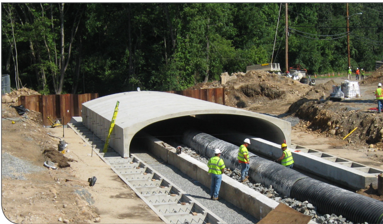
RIDOT Frenchtown Brook Bridge - East Greenwich, Rhode Island - EXPRESS Foundations used with CON/SPAN Bridge System