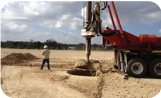
Setting the cellar occurs prior to any drilling.

Sections are lightweight for economical transportation to the well.