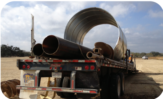
Lightweight for easy handling and transportation.