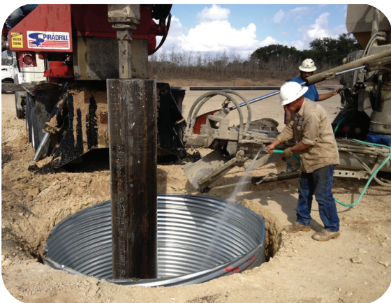
CSP Cellars provide a safe recess to ground surface access.

A cellar is a large diameter pipe that is set into the ground to provide the initial stable structural foundation for a borehole or oil well providing a recess to ground surface for access and safety. This is typically set before any drilling operations are performed.