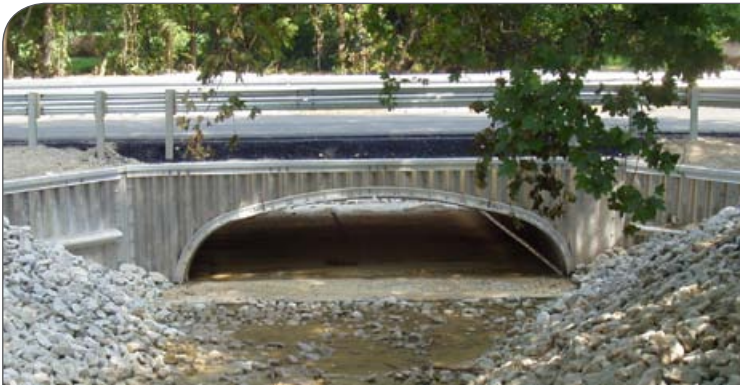
Vehicular stream crossing – versatile application offering easy maintenance of traffic above and below the structure