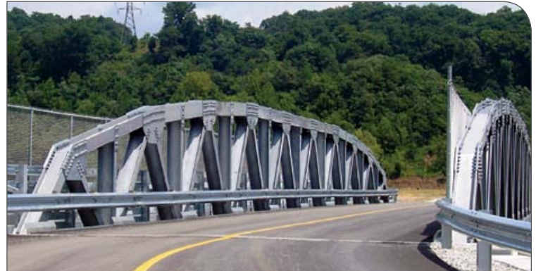
Development entrance – part of city's revitalization project, providing vehicular access to main facilities