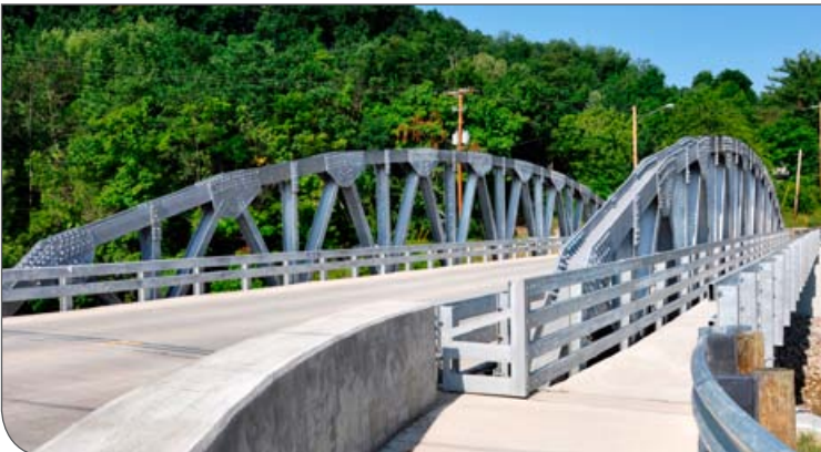
Highway overpass – increase rise for greater clearance in underpass structures and drainage structures