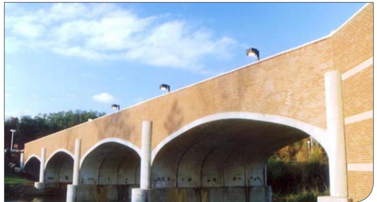
Multiple cells – span length increased with side-by-side installation of precast cells