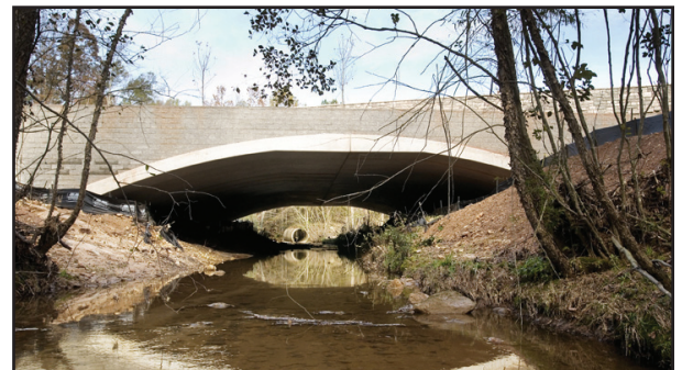
Wetlands application - with 72 ft spa