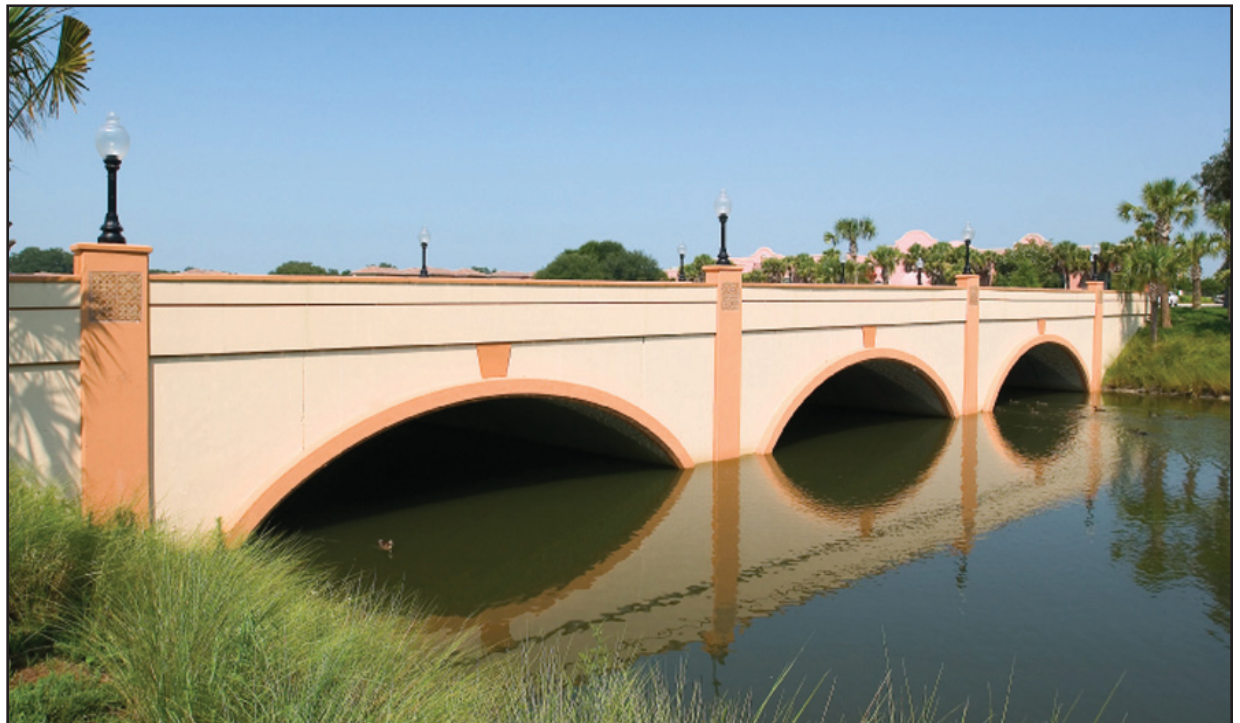
Multi-span aesthetic application for development