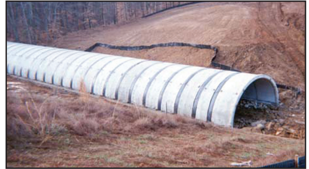
Stream enclosure - with 40 ft of fill