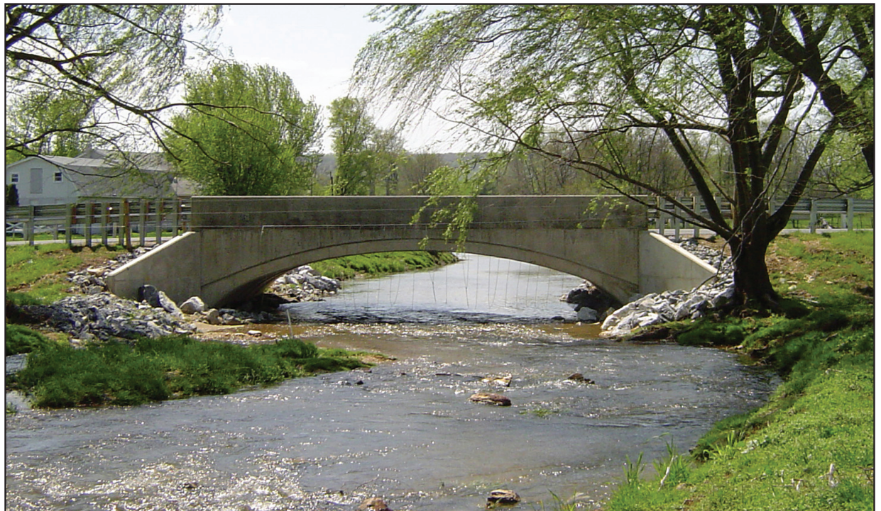
Stream crossing, environmental application